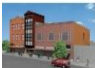
The Heritage Building