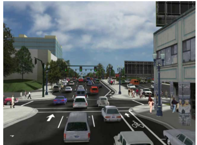
Proposed E. Burnside Street looking east.