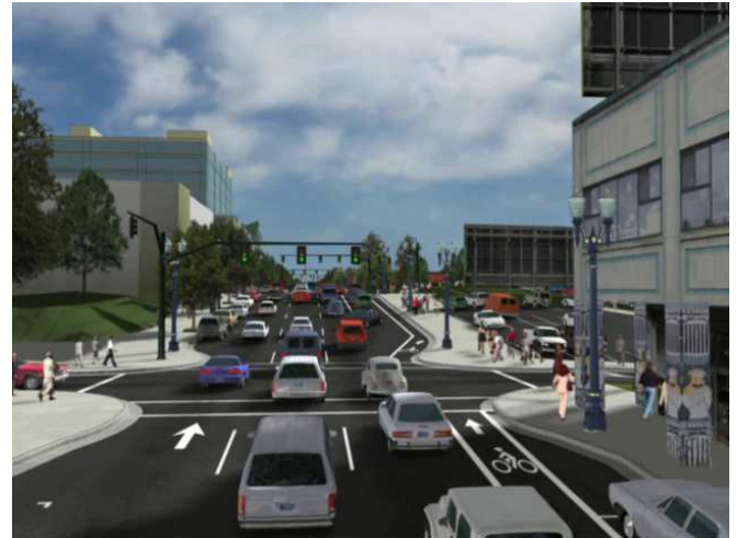
Proposed E. Burnside Street looking east.