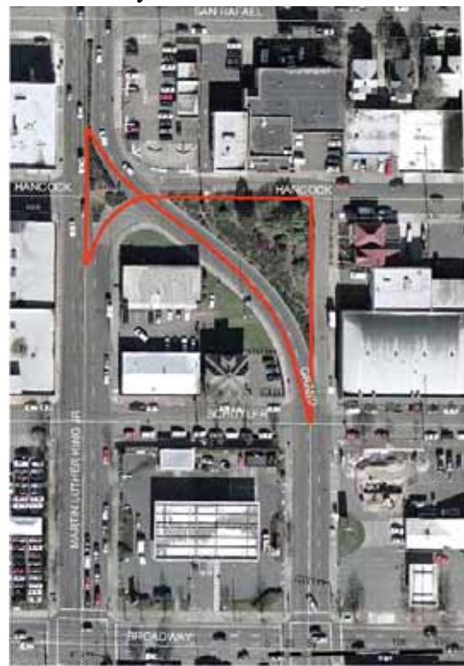
Figure 1 Gateway Site

The site is zoned EXd (Central Employment with a design overlay). This zone implements the Central Employment map designation of the Comprehensive Plan. The zone allows mixed-uses and is intended for areas in the center of the City that have predominantly industrial type development. The development standards are intended to allow new development which is similar in character to existing development.