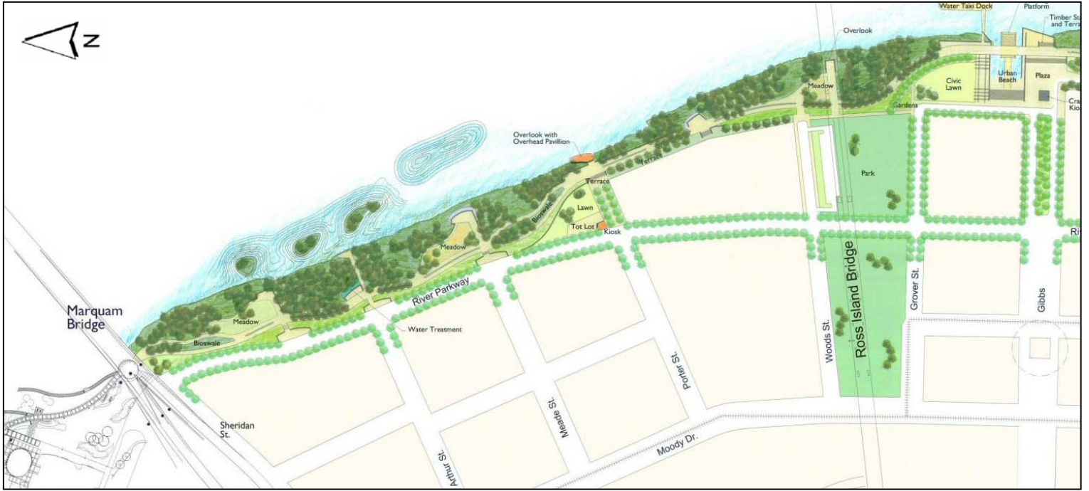
North Portion – Marquam Bridge to Gibbs Street